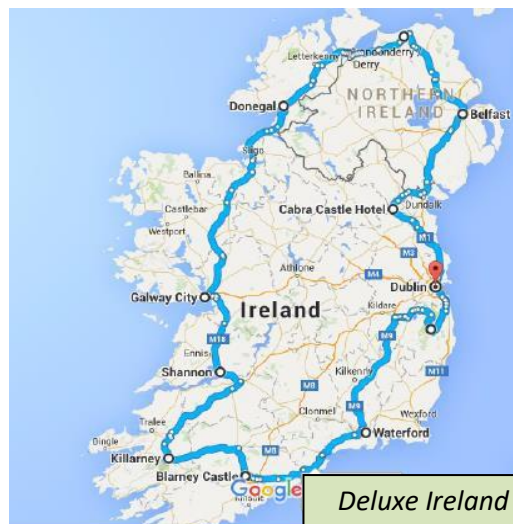
Deluxe Ireland Adventure!

This morning after breakfast pack your bags and head for Dublin airport where you will board your flight for home. Carry on your photos and memories and bring a bit of the Emerald Isle home with you. 'The Land of One Hundred Thousand Welcomes' will be expecting you again soon! Slán leat! (Goodbye in Irish)